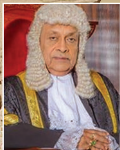
HON KARU JAYASURIYA SPEAKER OF PARLIAMENT